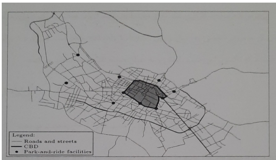
Figure 2: The studied areas, along with the prohibited area and location of private car parking spaces.

The traffic allocation to these links is implemented in MATLAB software.