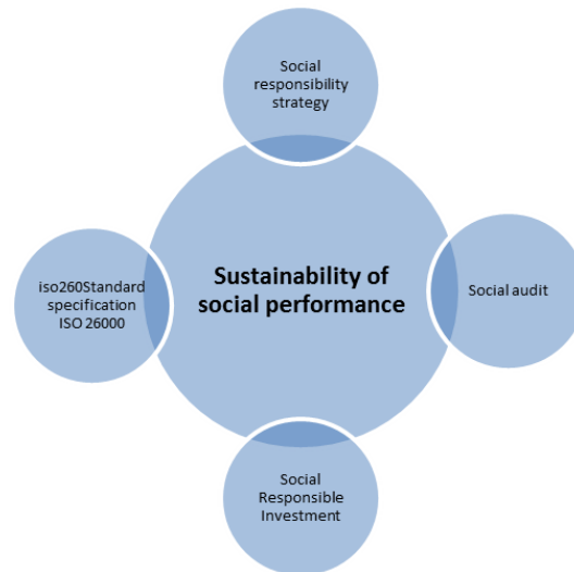
Figure 3: The four dimensions of sustainability for social performance