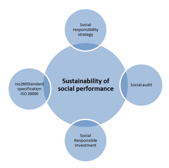
Figure 3: The four dimensions of sustainability for social performance