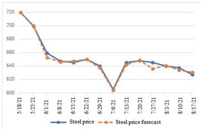
Figure 4: Comparison of forecasted values of the hybrid model with real values