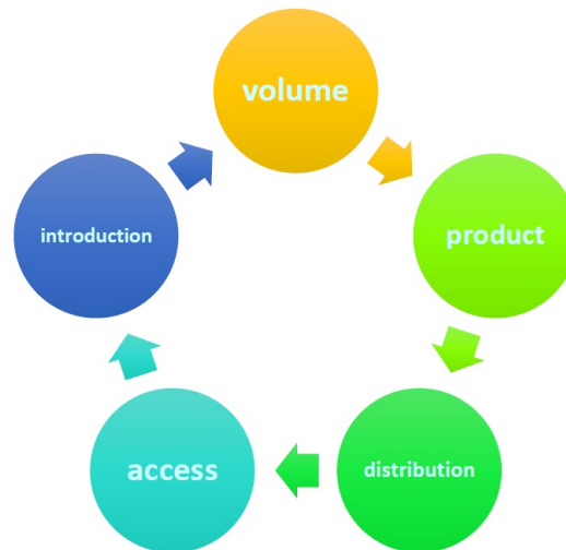
Figure 1: Five-dimensional model of supply chain flexibility

as the degree of adaptation of production volume in response to various market changes. Vickery et al. [41] presented supply chain flexibility in the following form: