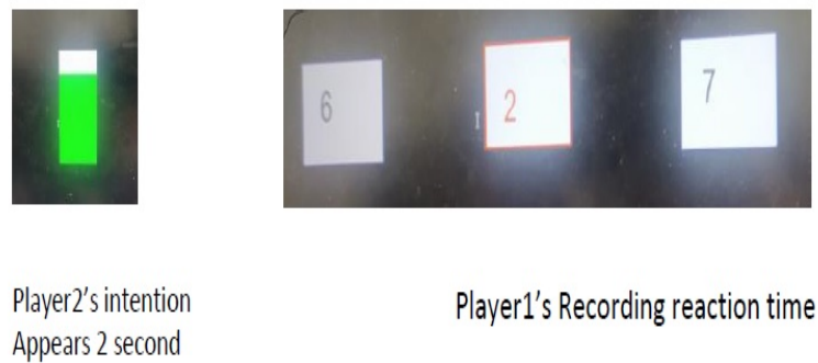
Figure 2: Stages showing the player2's intention and selection modes for the player 1

the airline, and the one who announced a higher amount will receive the minimum amount announced by the parties minus the fine that the airline will pay.